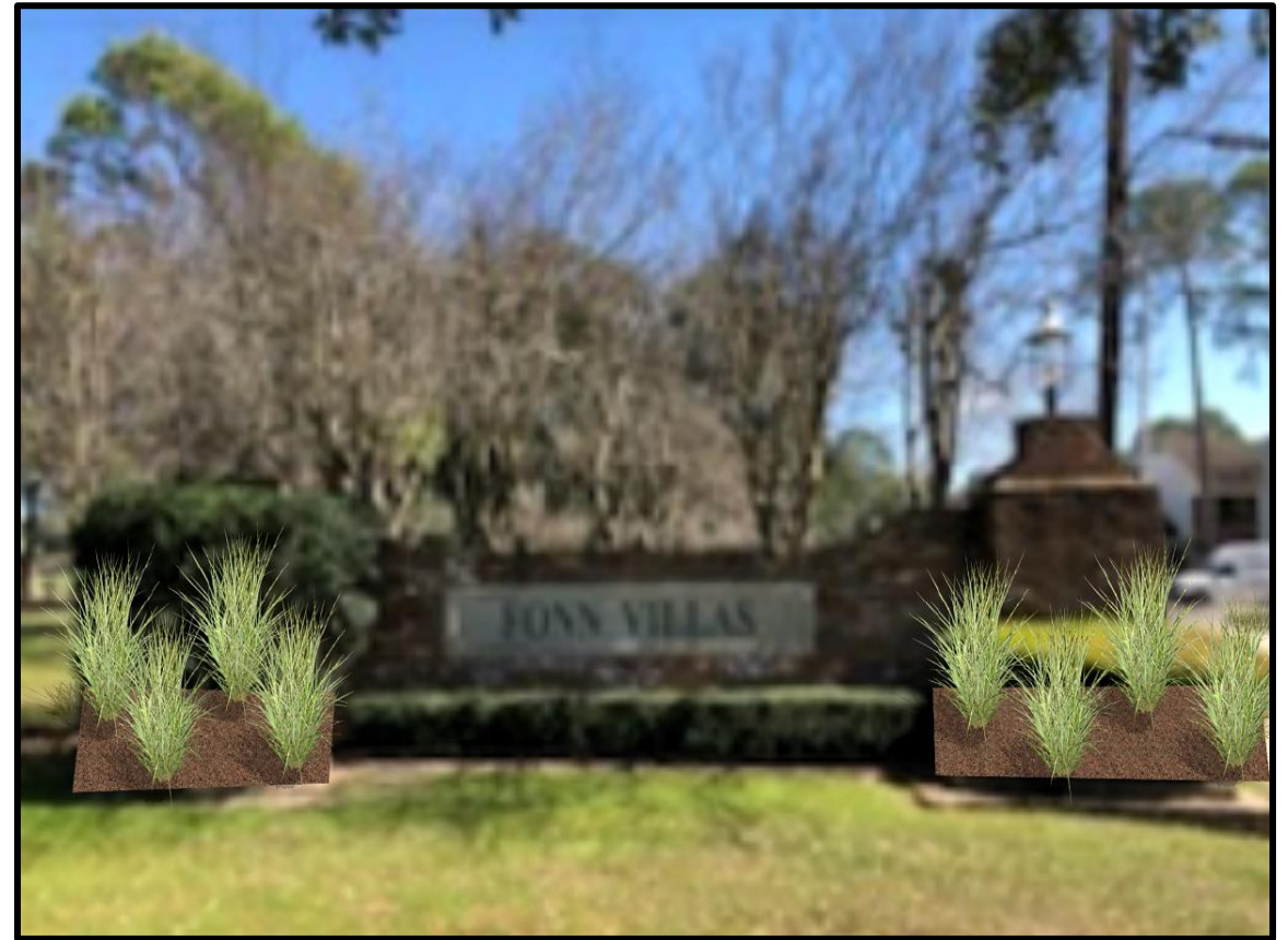
Removing the Ligustrum & Boxwood and replacing with 3gal Variegated Flax Lilly