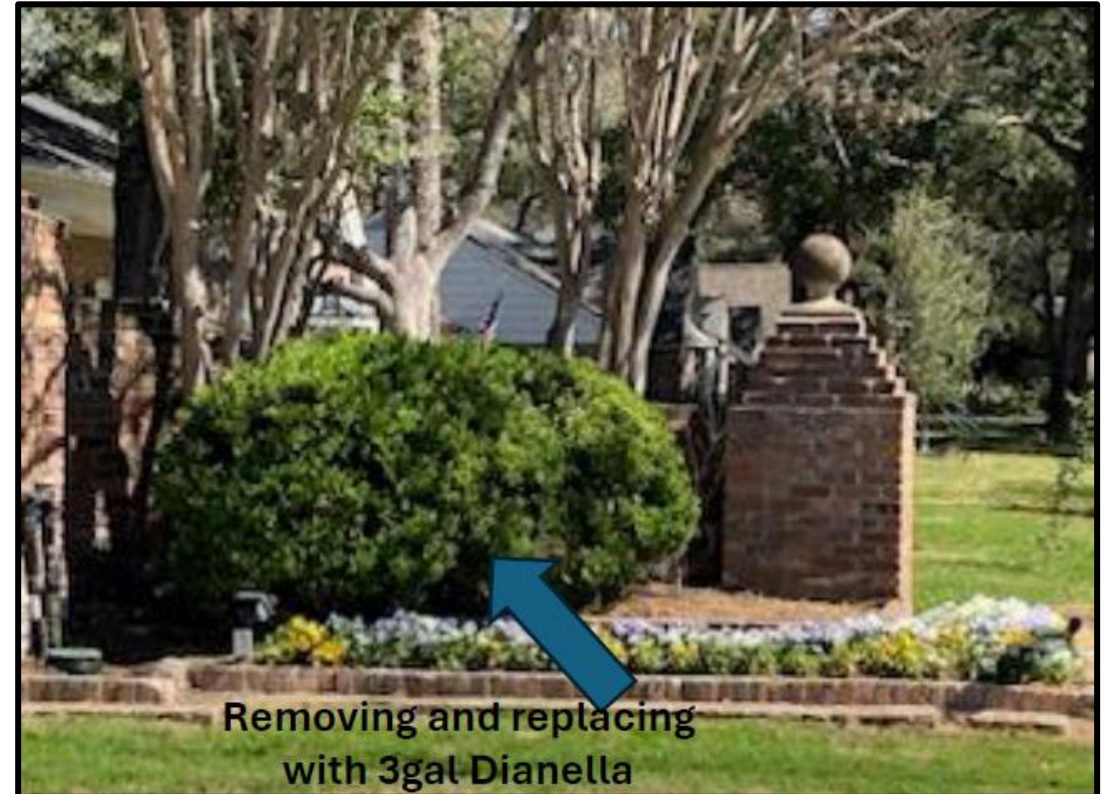
Removing old Boxwood and replacing with 3gal Variegated Flax Lily