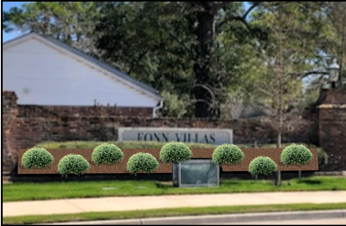
Removing the old Boxwood and replacing with 3gal Dwarf Yaupon Holly