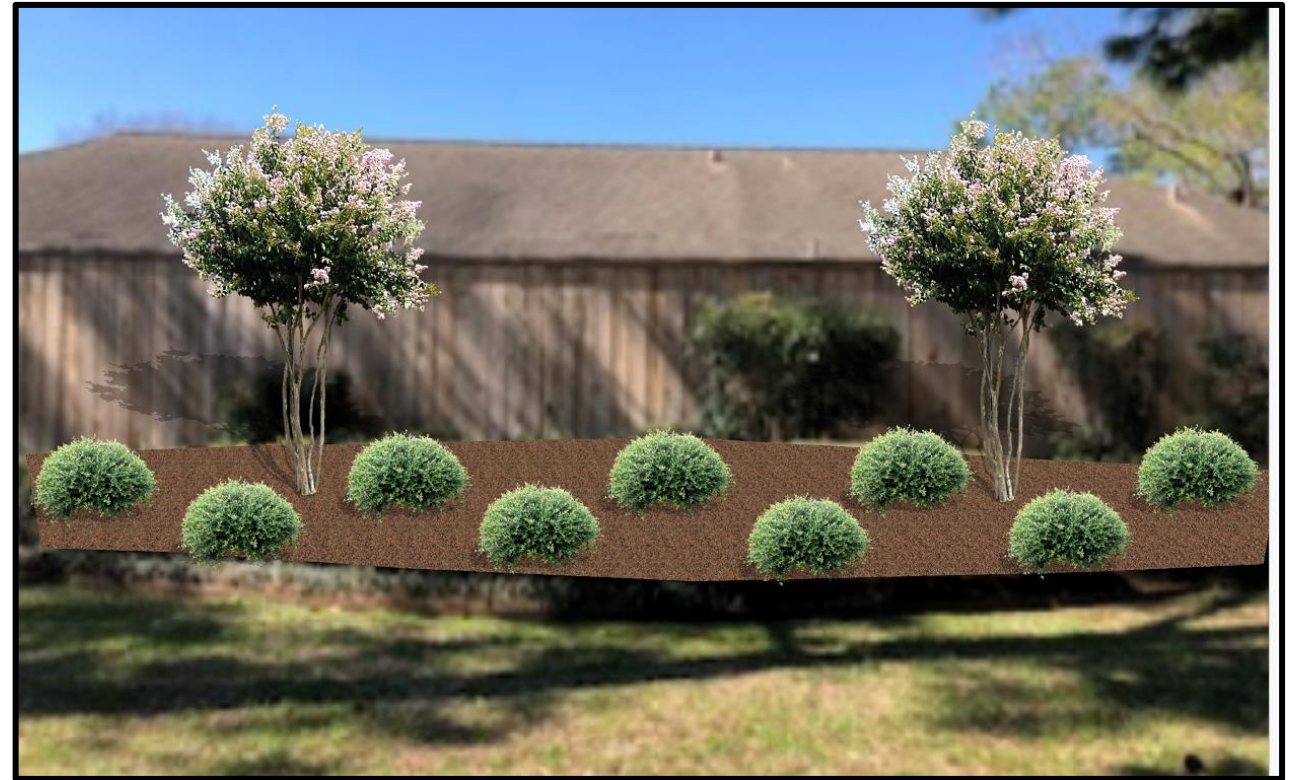
Right side pool entrance

Removing nandina, damaged boxwood, & Holly. Installing (2) 15gal Crape Myrtles and 3gal Dwarf Yaupon Holly