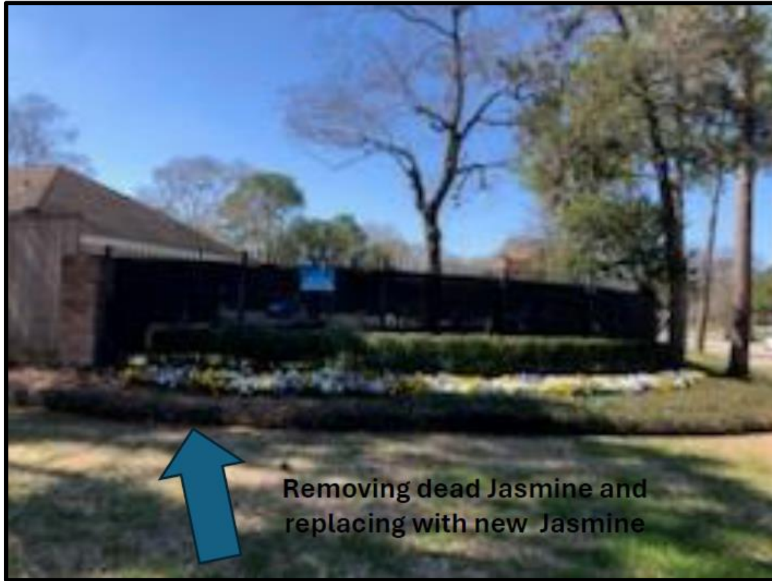
Front Bed @ Pool

Removing dead Jasmine and replacing with new 1gal Jasmine