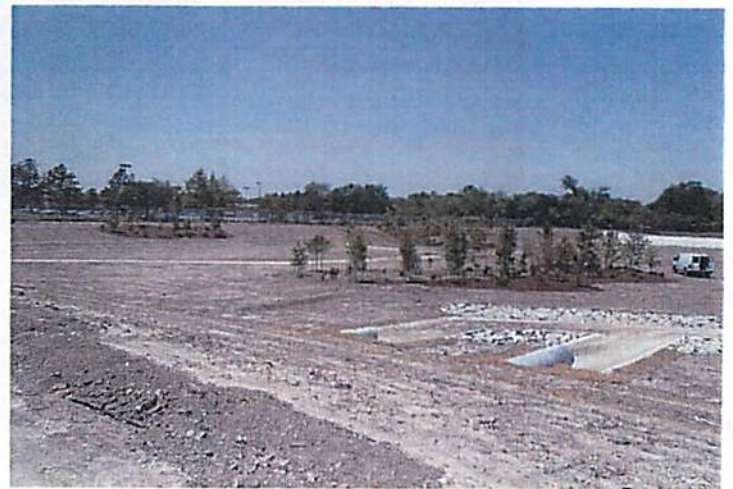
Phase II - Tree grouping- Looking northwest.