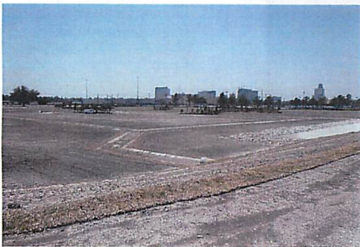
Phase II - Tree grouping- Looking southwest.