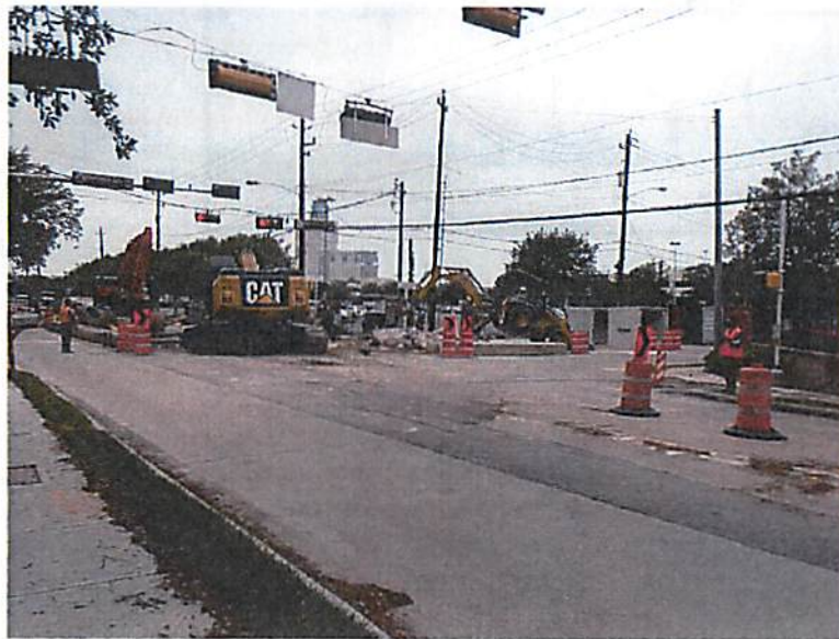
Peace officer assisting with traffic control.