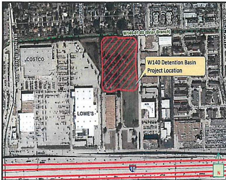
Not to scale

The proposed regional detention site is located 1300 feet east of Bunker Hill Road and on the south side of Briar Branch. The basin site is immediately adjacent to and east of a major shopping center located at the northeast corner of Bunker Hill Road and IH-10.