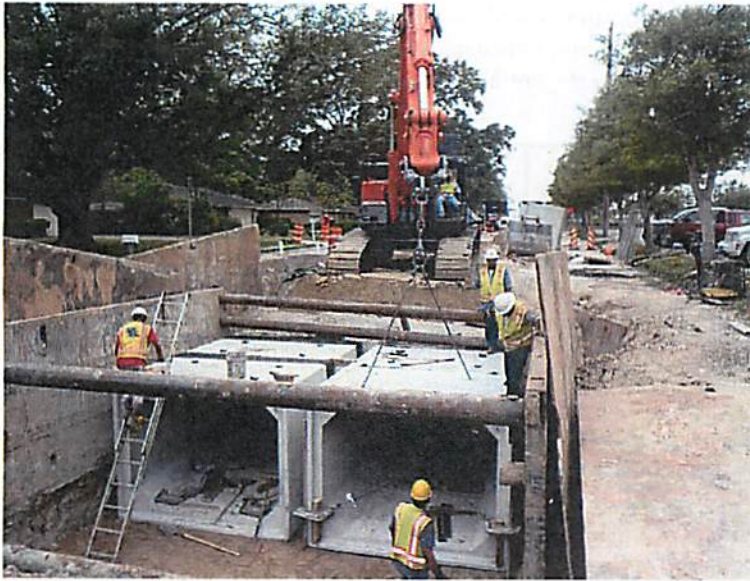
Moving section of RCB into place.

* For more information please refer to TIRZ 17 website