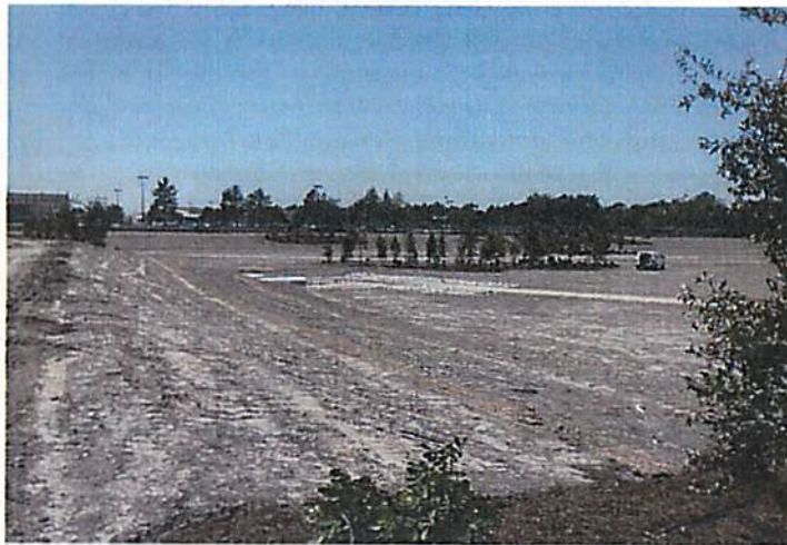
Phase II - Tree grouping- Looking west.