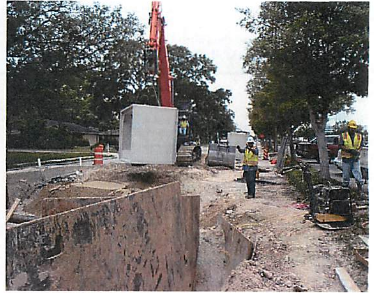
Installing RCBs west of Memorial City Way.